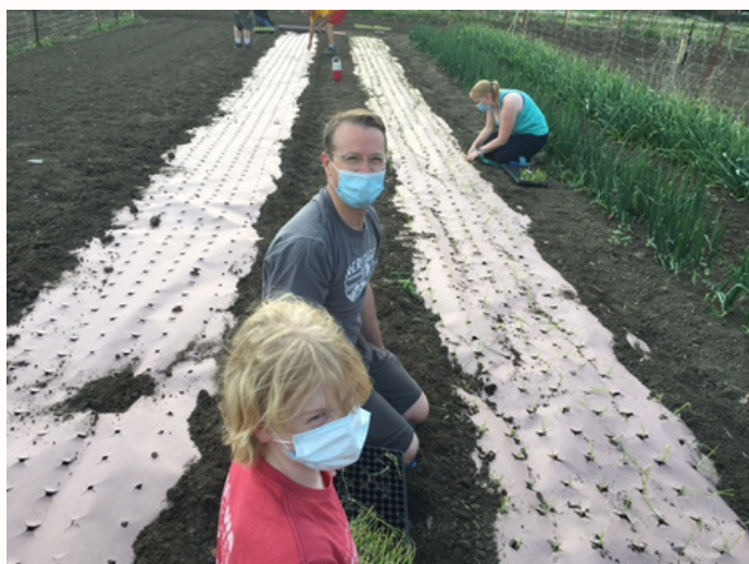
Coens in the garden!