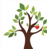
Saint Timothy's Preschool

Feel free to share the link with friends or family who are looking for a great preschool experience!