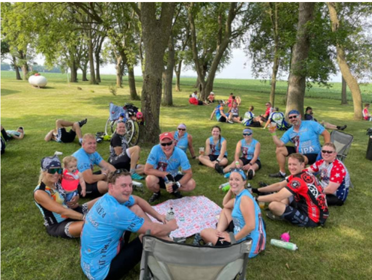
Multiple Mables and friends on RAGBRAI!