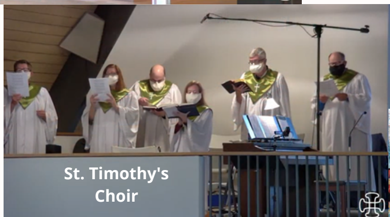
St. Timothy's Choir