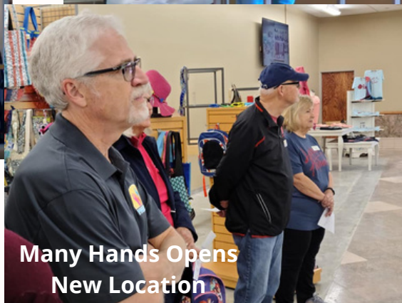
Many Hands Opens New Location