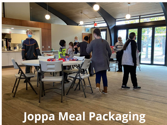
Joppa Meal Packaging