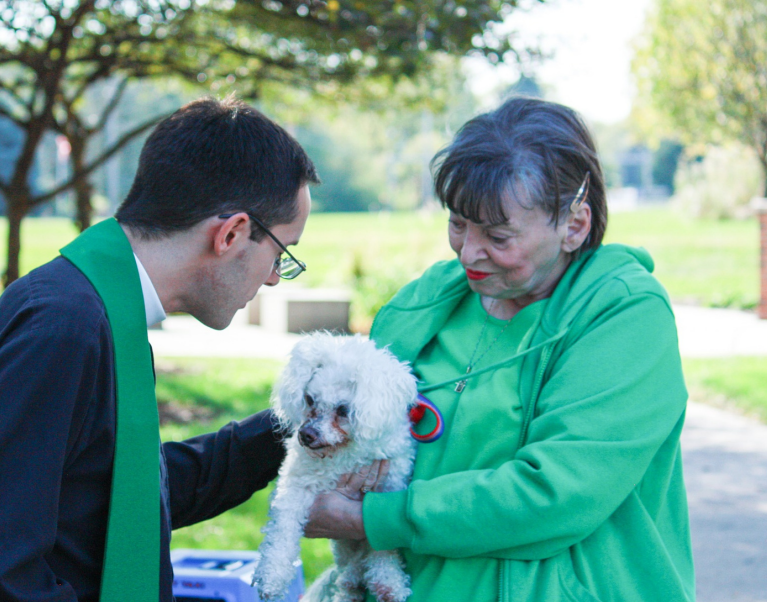
Blessing of the Animals