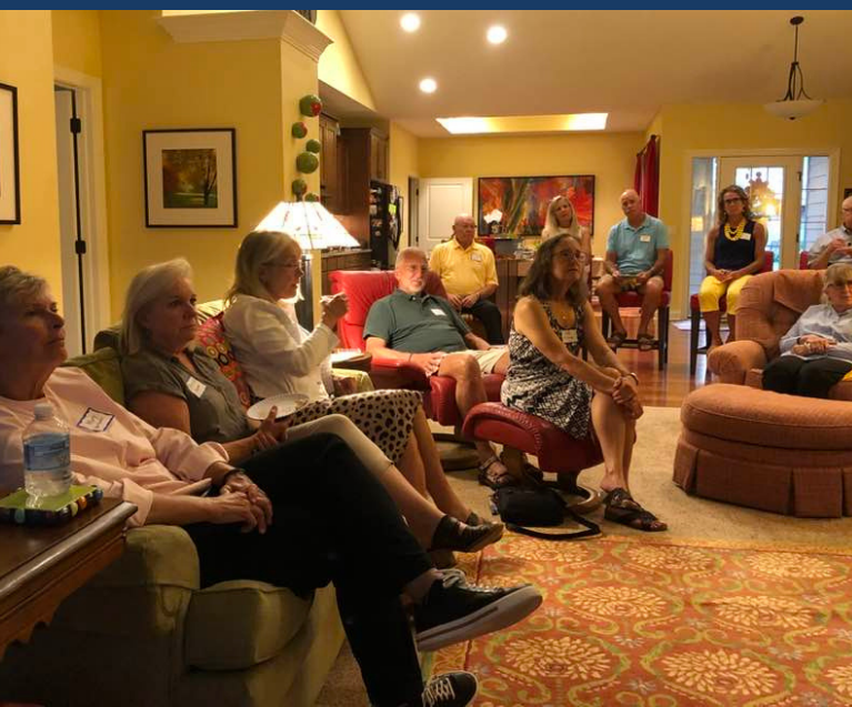
Parishioners at a Meet-the-Rector Home Gathering

St. Timothy's Day is our yearly chance to celebrate our patron saint and gather together as a parish to look back on the previous year and ahead to what's to come. Following our service, there will be a meal in the Parish Hall, reports from ministry leaders, and the election of our newest vestry members. We hope to see you there!