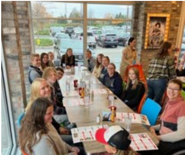
High School Formation Breakfast Out