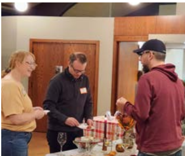
Newcomers Welcome Dinner