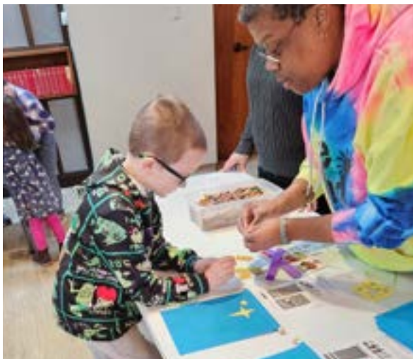
Epiphany Celebration Craft