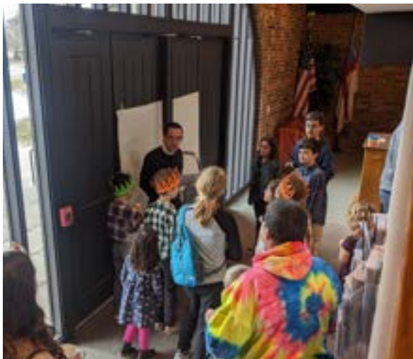
Chalking the Door