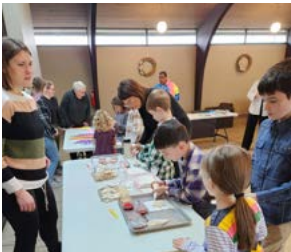
Epiphany Celebration Cookies