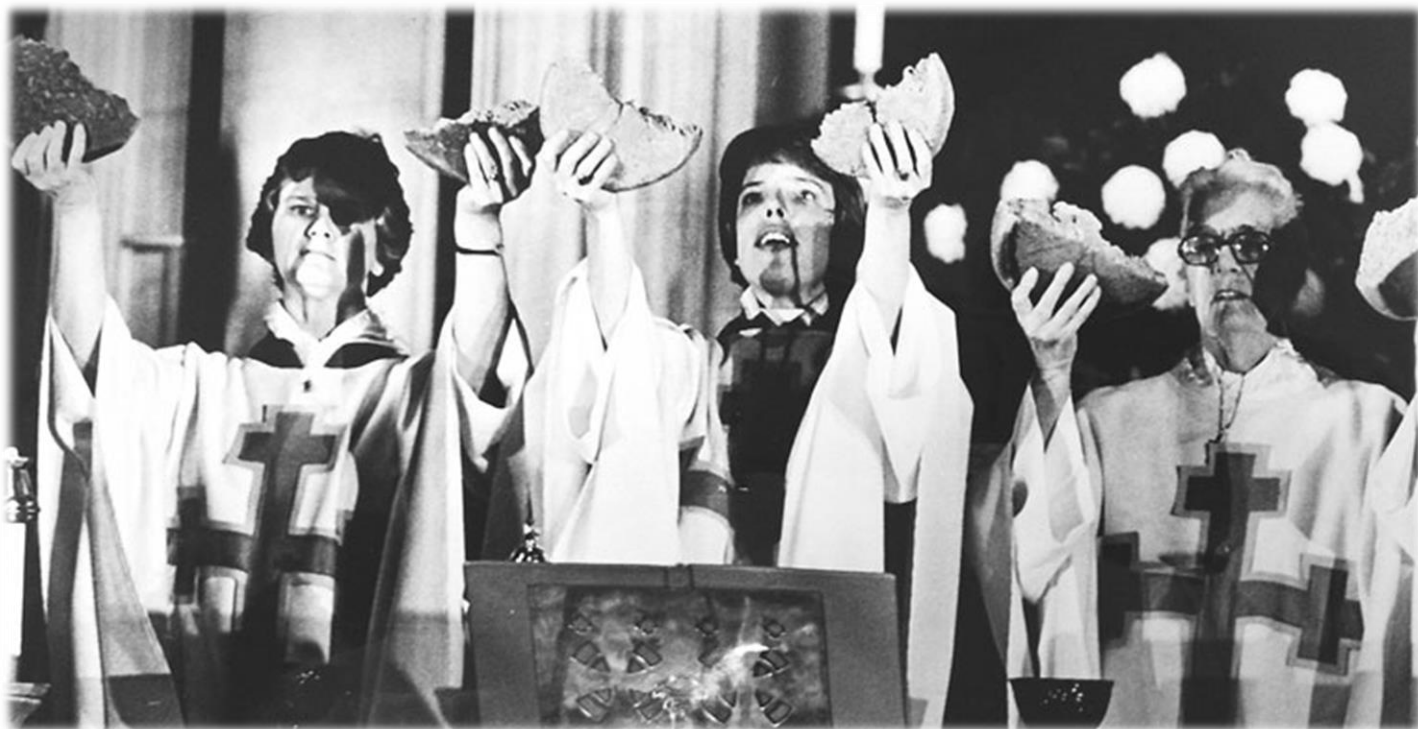
Three of the “Philadelphia 11” celebrate the Eucharist for the first time.