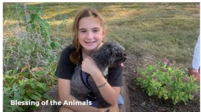
Blessing of the Animals