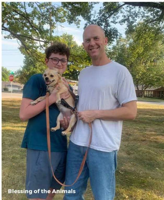
Blessing of the Animals

12/21 What Does It Mean That God Became Human?