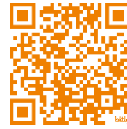
Parade Sign Up