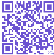
Booth Sign Up